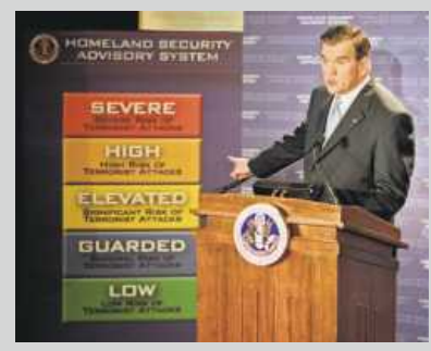
Then-Homeland Security chief Tom Ridge introduces the color-coded alert system on March 12, 2002. The system was retired in 2011.

The Department of Homeland Security retired the Homeland Security Advisory System — the color-coded terrorism threat advisory scale — in 2011. In its place, it instituted the National Terrorist Advisory System, whereby DHS shares information about credible terrorist threats via DHS.gov/alerts, social media and news media. Advisories are now "Elevated" if DHS lacks specific information about the timing or location of a threat, or "Imminent" if DHS believes the threat is impending or very soon.