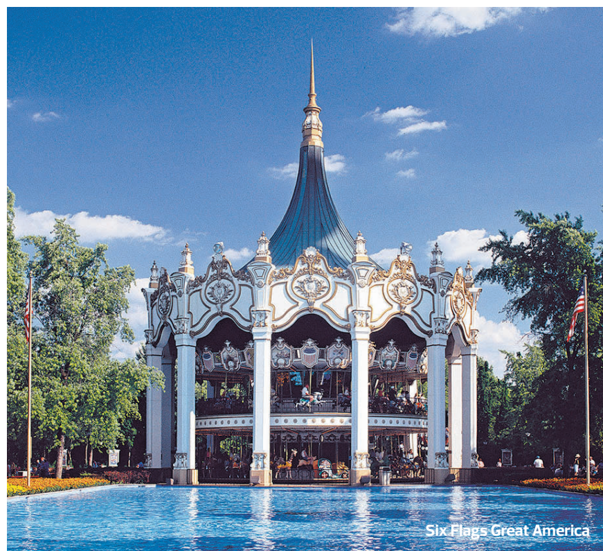
SIX FLAGS GREAT AMERICA

► 1 Great America Parkway, Gurnee; sixflags.com/greatamerica