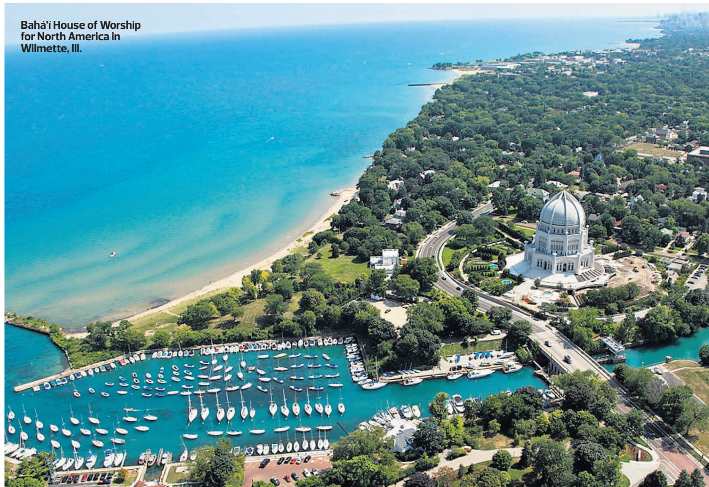
Bahá'í House of Worship for North America in Wilmette, Ill.