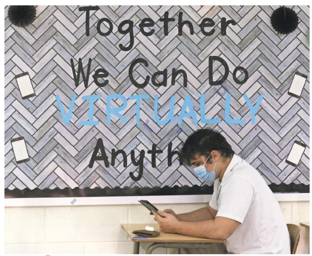
Schools across the U.S. have had to reconfigure their classrooms for hybrid learning, in which some students attend in person and others are online in order to reduce the number of people in each room at any given time. Desks are farther apart, masks are required, and the lights are often dimmed because so much is happening on computer screens. Above, Paramus Catholic High School in New Jersey, where students alternate three days in school and three days virtual.

"We know that being outside is great for COVID risk mitigation. And oh, by the way, kids love learning outside, so it's ac-