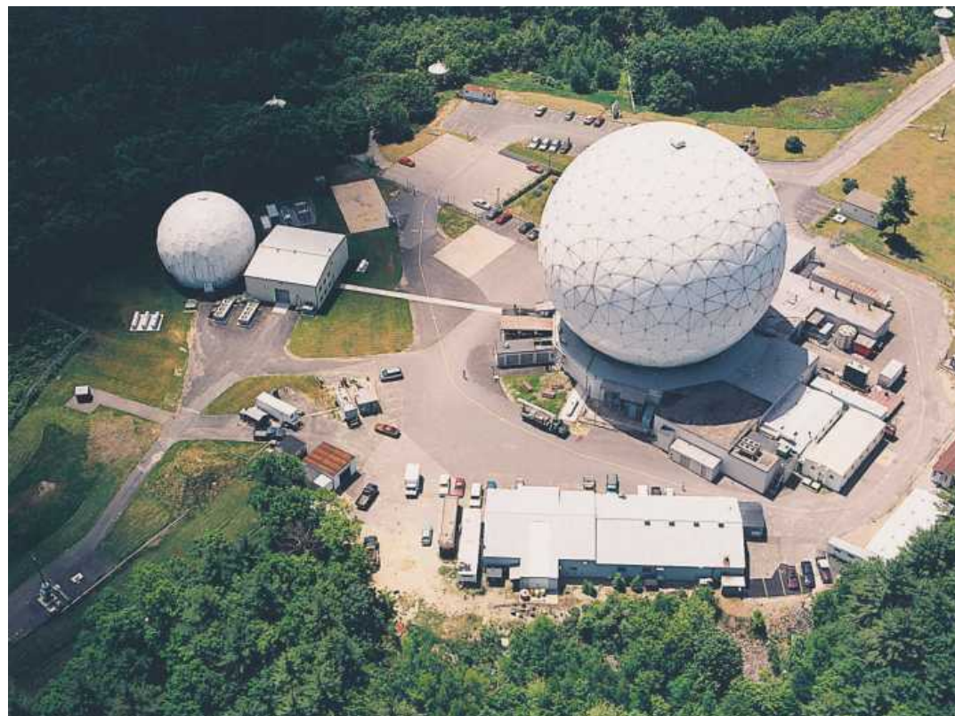
Radar stations in Tyngsboro, Mass., serve as NASA's main sentry for tiny bits of space debris, some as small as one centimeter. The radar collects 600 hours' worth of data per year.

There are more than 60 countries and dozens of companies with satellites in orbit, but no international body regulates them.