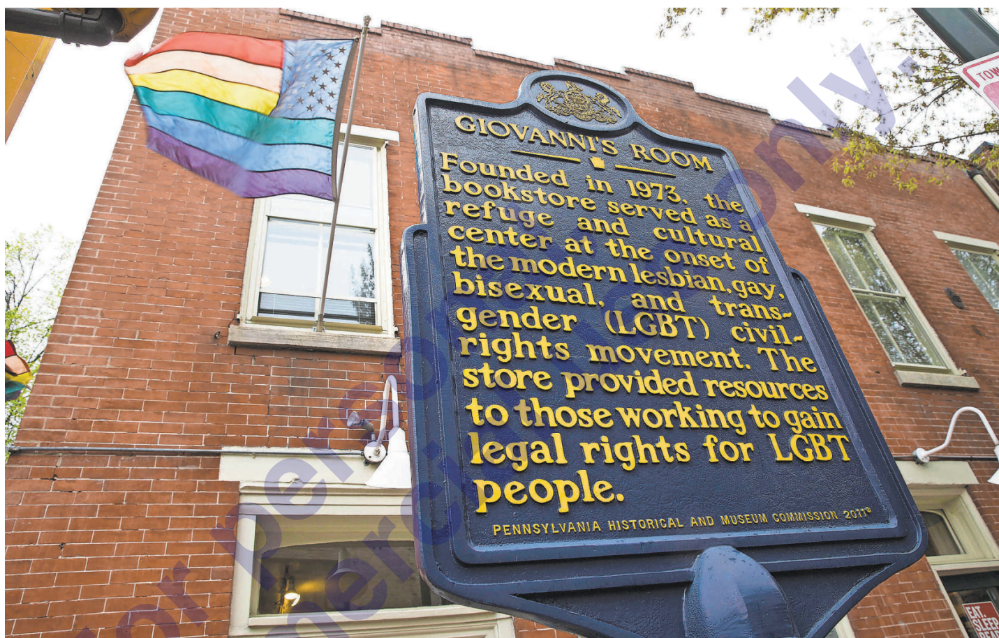
A historical marker outside Giovanni's Room in Philadelphia tells the story of the shop that claims to be the nation's oldest gay bookstore. When the store opened at its original location in 1973 — it has moved twice and changed ownership since then — there were so few books available on LGBTQ topics that the inventory occupied a single shelf.

Named after the 1956 novel by gay author James Baldwin, Giovanni's Room ( queerbooks.com ) traces its history to 1973, when four LGBTQ activists established a store on the 200 block of South Street. At that time, there were so few books on LGBTQ topics that the store's inventory occupied only a single shelf.