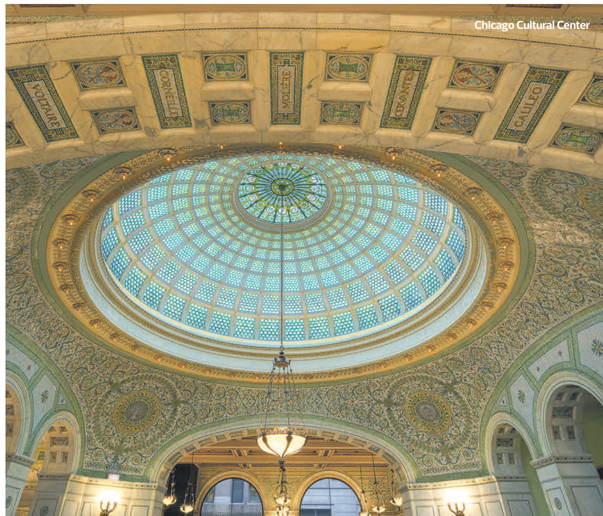
Chicago Cultural Center