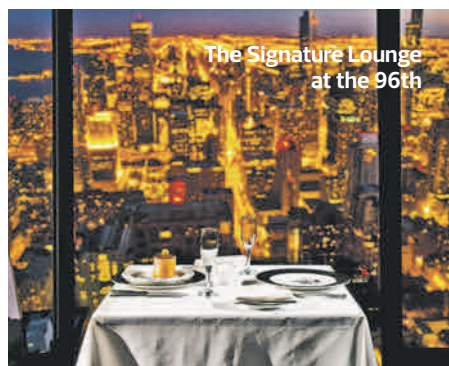
The Signature Lounge at the 96th