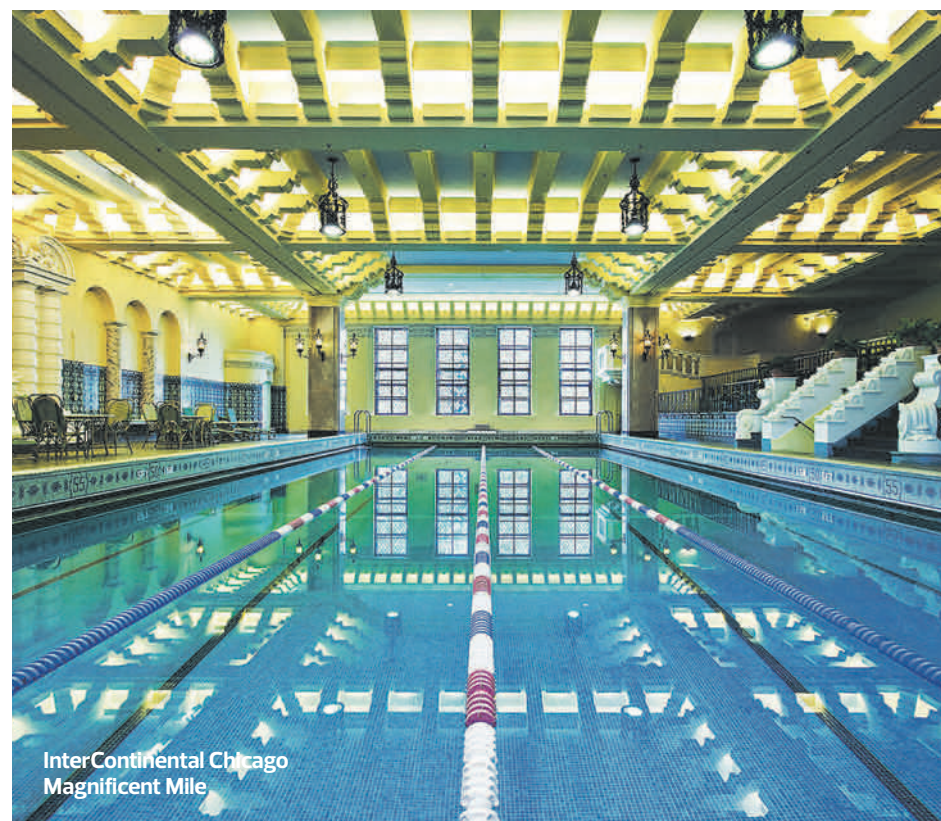
InterContinental Chicago Magnificent Mile

★ 505 N. Michigan Ave.; 312-944-4100; icchicagohotel.com